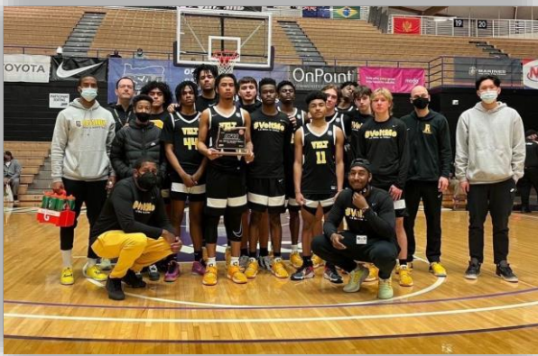
Roosevelt Boys Basketball after playing South Medford and taking home the 6 th place trophy.

Cleveland won its first PIL District Championship since 1962 and Roosevelt appeared in the state championships for the first time since 1958. The PIL had six (6) boys basketball teams compete in the OSAA state championships. Lincoln made it to the 2 nd round, only to lose to Cleveland by 10. Benson made it for the first time since 2012 but fell short to Mountainside. Wells lost to West Linn in the 1 st round, while Grant lost in the 2 nd round to Beaverton by 1 point. Roosevelt and Cleveland advanced to the quarterfinals but both teams lost – Cleveland in overtime and Roosevelt by 1 point at the buzzer. Roosevelt went on to beat Cleveland in the consolation bracket by 4, for a chance to play for 4 th / 6 th place. They lost by 4, taking home the 6 th place trophy.