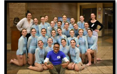
The Grant Gendrills took 5 th place in Show at the OSAA State Championships.