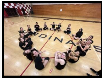
The Lincoln Cardinals took 9 th at the OSAA State Championships