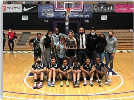
Benson Girls Basketball after beating Lakeridge to take 4 th place at the OSAA State Championships.